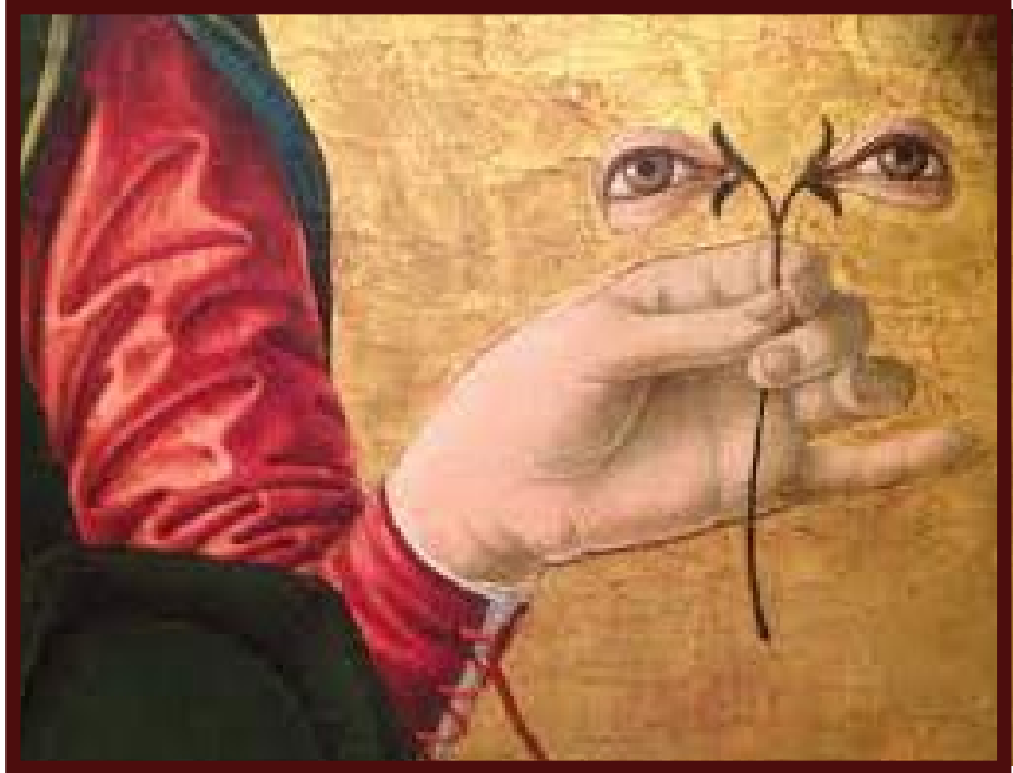
detail from Francesco del Cossa's "Saint Lucy," c. 1473