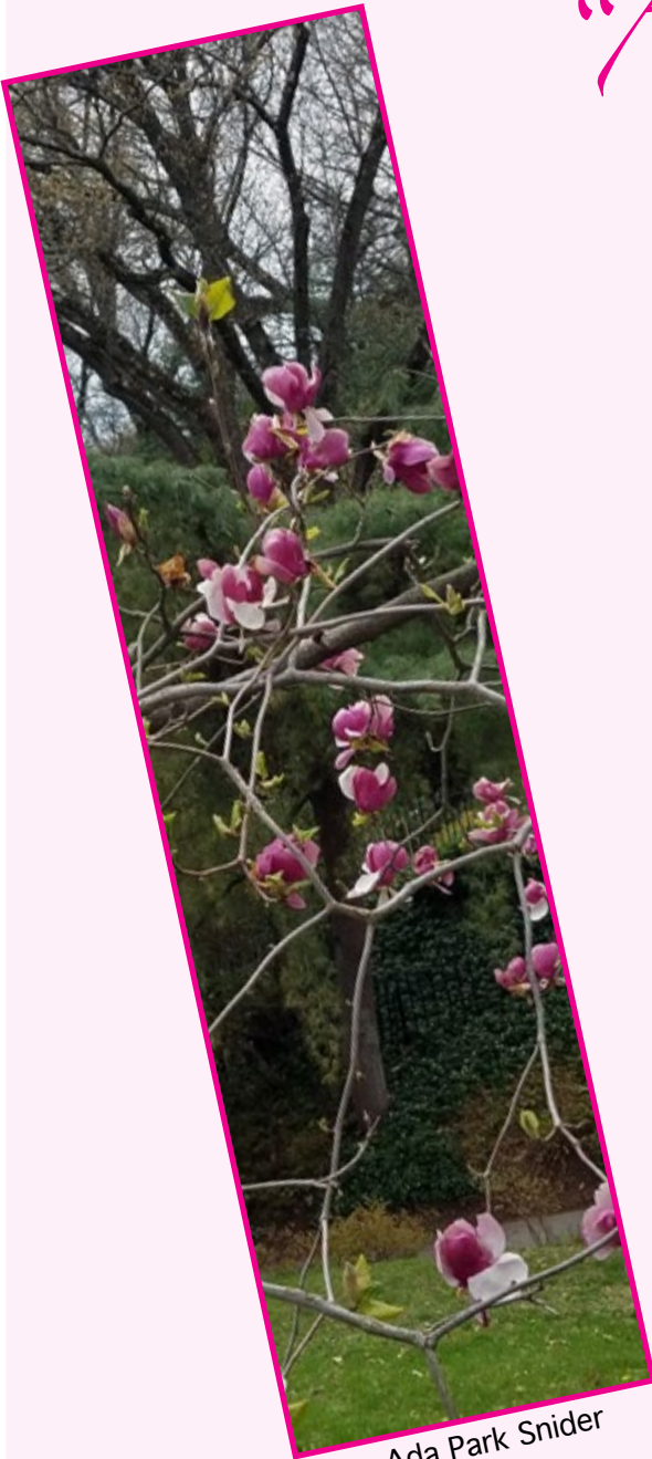
Ada Park Snider

“A picture is a poem without words.” Horace