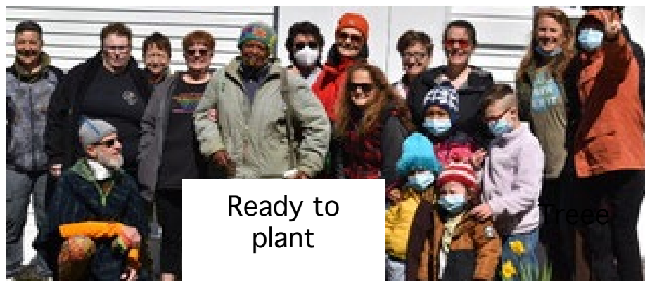
Ready to plant