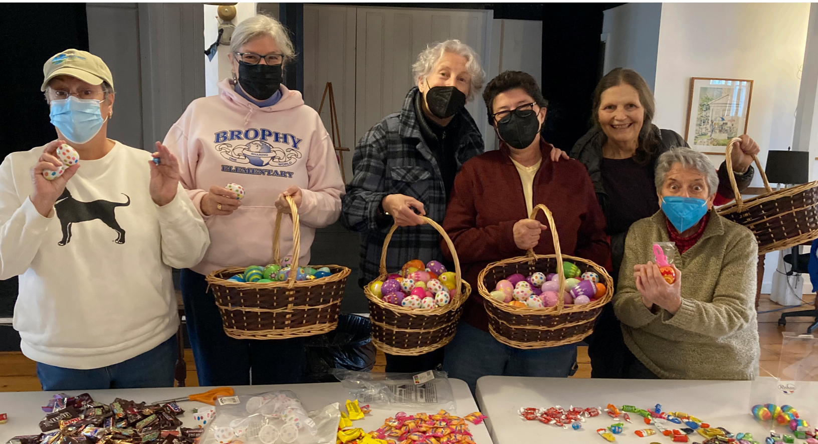
Hop to it, you sweeties!